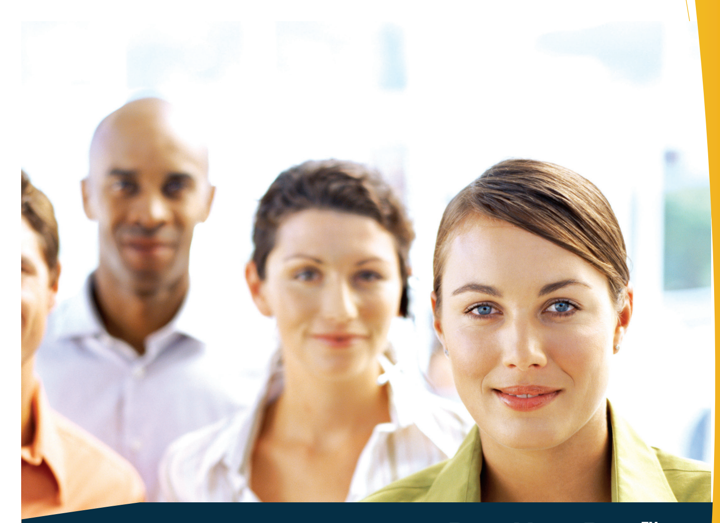
Beat Your Best™ Increasing Sales Proficiency

1630 W. Diehl Rd. Naperville, IL 60563 630-778-9914 ph beatyourbest@wiboc.org www.wiboc.org web